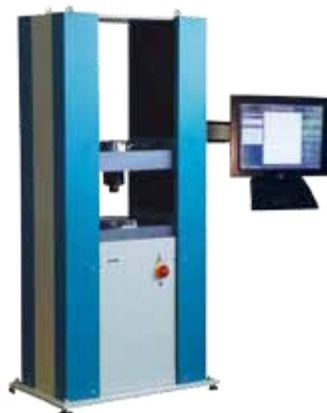
35-5100 万能实验机 200千牛顿 Universal Testing Machine 200 kN