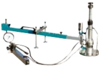
10-2350 板承载实验 100 千牛顿 Plate Bearing Test Set 100 kN