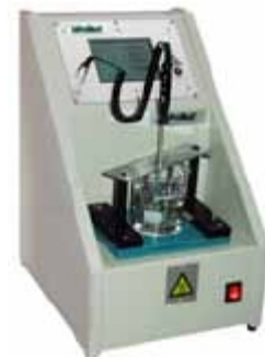
20-2200 自动球环实验仪 Automatic Ring and Ball Tester