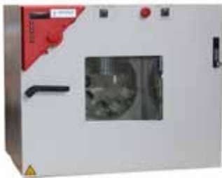
20-2572 旋转薄膜烘箱实验仪 Rolling Thin Film Oven RTFOT